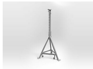
HS08LR support stand, 8.2 t, 1260-1990 mm