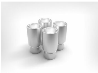
FHB3000-LA02 4 extension tubes, 100 mm