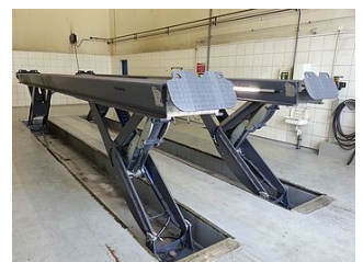
HDSF07DUROPLEX-XX Special coating in addition to galvanizing