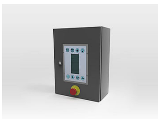
HDSF07-SK01 2. control box in the washing area