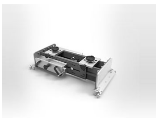
HDSMHFL160-200-F07 jacking beam 16 t, pneumatic