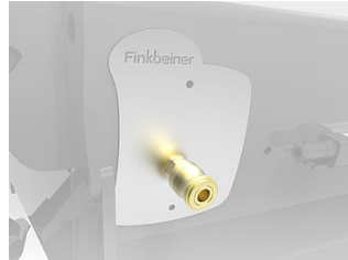
HDSF07-DL02 Pneumatic sockets