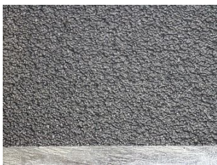
HDSF07-AS02 anti-skid surface R13