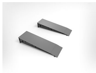
HDSF0713-235 2 ascending ramps, 2350 mm