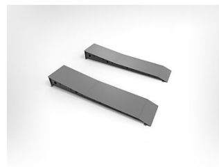
HDSF0713-330 2 ascending ramps, 3300 mm