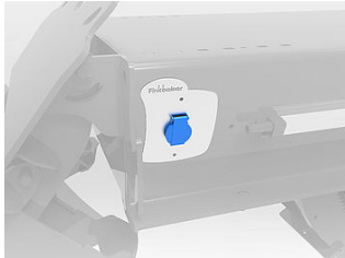
HDSF07-ST02 Electric sockets 230V