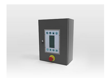
2. control box in the washing