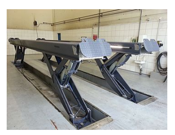
HDSF07DUROPLEX-XX Special coating in addition to galvanizing