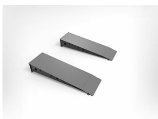
HDSF0713-235 2 ascending ramps, 2350 mm