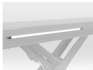
HDSF07-BL-LEDXX Set with 4 to 10 LED lamps