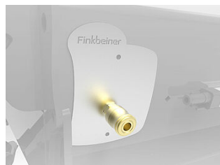
HDSF07-DL02 Pneumatic sockets