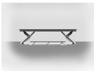
HDSF07BA-XXXXX floor levelling for pits of platforms