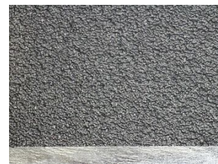
HDSF07-AS0X anti-skid surface anti-skid class R13