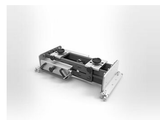
HDSMHFL160-200-F07 jacking beam 16 t, pneumatic