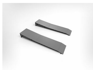
HDSF0713-330 2 ascending ramps, 3300 mm