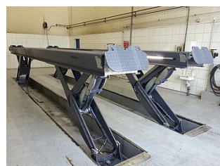
HDSF07DUROPLEX-XX Special coating in addition to galvanizing