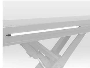
HDSF07-BL-LEDXX Set with 4 to 10 LED lamps