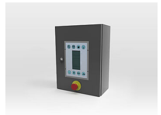
HDSF07-SK01 2. control box in the washing area