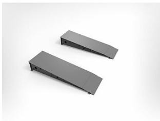
HDSF0713-235 2 ascending ramps, 2350 mm