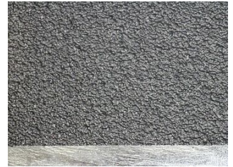
HDSF07-AS0X anti-skid surface anti-skid class R13