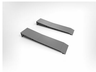
HDSF0713-330 2 ascending ramps, 3300 mm