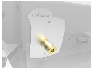
HDSF07-DL02 Pneumatic sockets